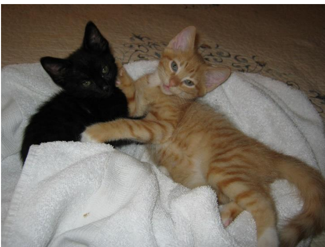
Poppitt and Robin, just after adoption, June 2017.