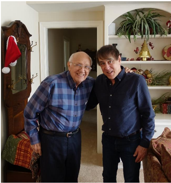
With father at his 90 th Birthday Party, Houston, August 2017.