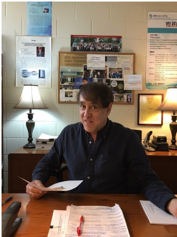
In UAH office, Huntsville, October 2017.