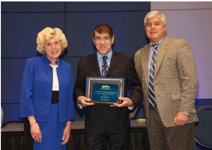
Receiving 2019 University Distinguished Research Award for Excellence, April 2019.