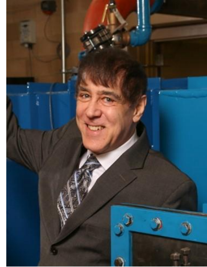
Within UAH Research Laboratory, March 2019.