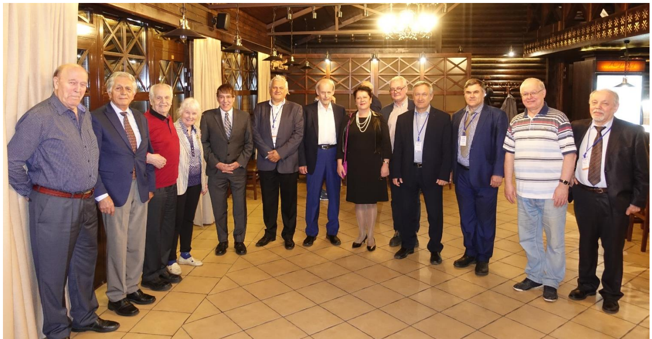
With members of the National Committee on Heat and Mass Transfer of the Russian Academy of Sciences, during the Seventh International Conference "Heat and Mass Transfer and Hydrodynamics in Swirling Flows," Rybinsk, Russian Federation, October 2019.